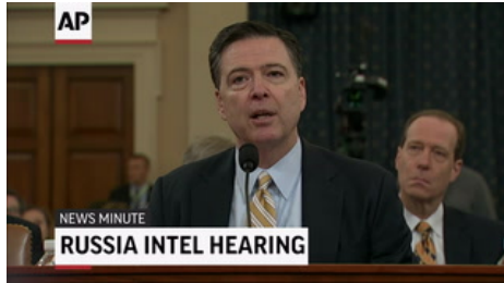
( http://patch.com/virginia/mountvernon/video-showcase?channel_id=ACNLYAr8&_video_id=Jt3iOyEa ) Comey Shuts Down Wiretap Reports; Gorsuch Hearings; Missing Brady Jersey Found: Top Stories, March 20